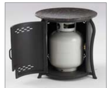
Optional side table/tank cover w/ English granite

* See price list or website for all available surround options.