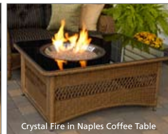
Crystal Fire in Naples Coffee Table

NOTE: Printing color may vary slightly from actual product.