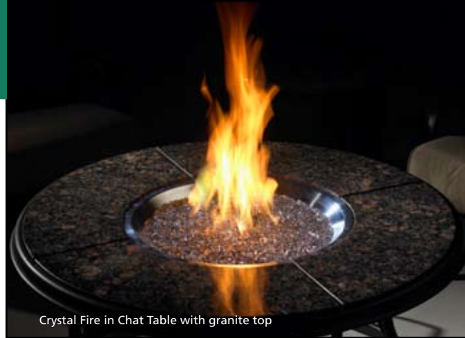
Crystal Fire in Chat Table with granite top