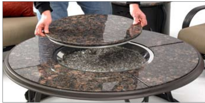
Crystal Fire in 42" Glass Table